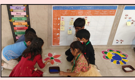
Setu - October, November & December 2024