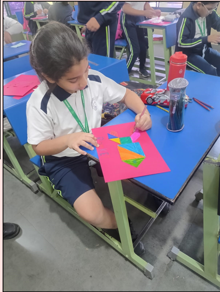
Setu - October, November & December 2024