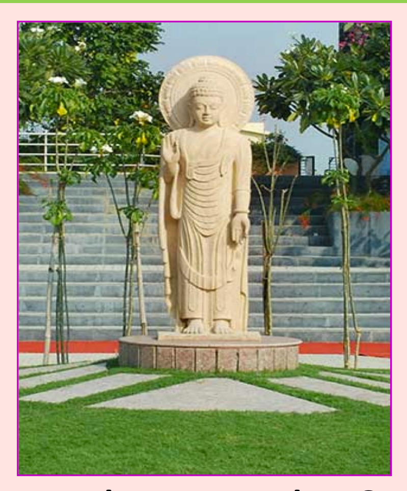
October, November & December 2024